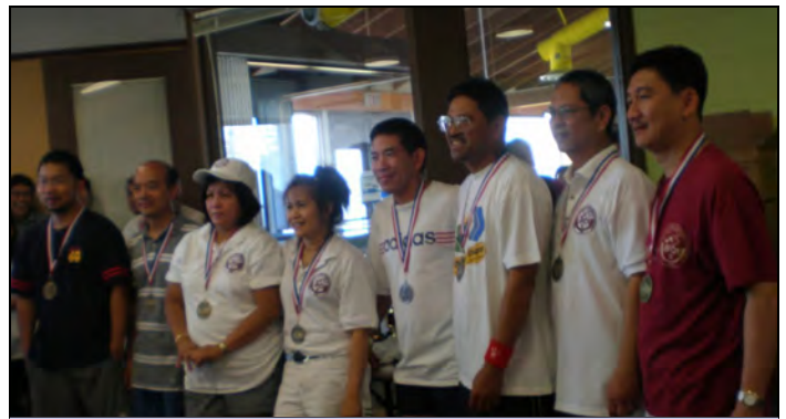
Tennis Tournament Group B