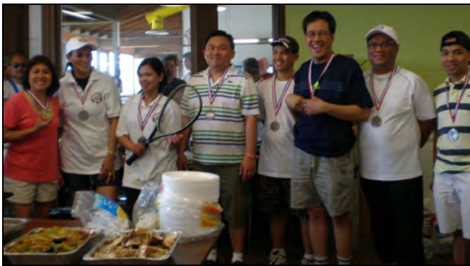
Tennis Tournament Group A