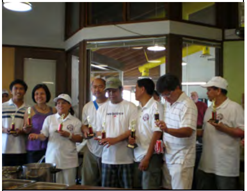
The Tennis tournament Champion Team