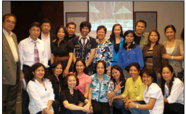
Tax Clinic Volunteers during the Appreciation Day