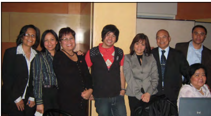
Search for Little Miss PIDC Tabulators