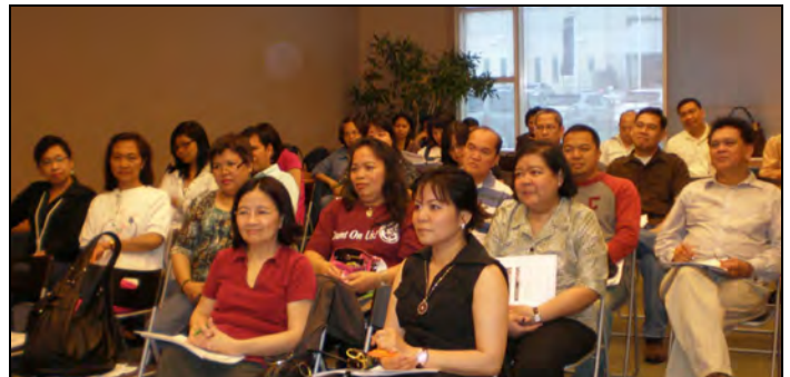
Participants seriously listening to HST updates