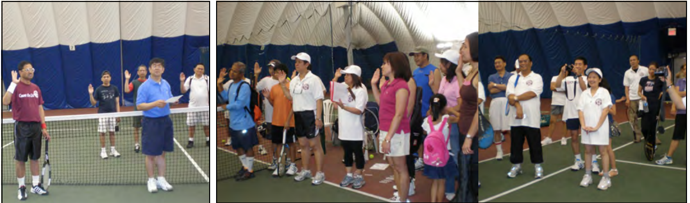
Pledge of Sportsmanship