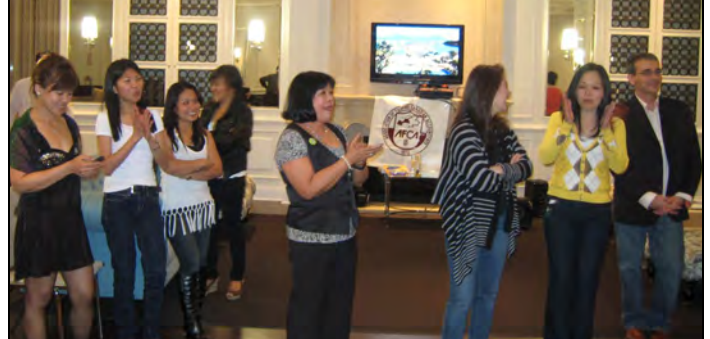
AFCA Got Talent Contenders