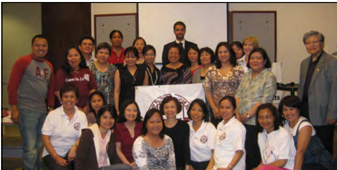
AFCA members who are HST ready