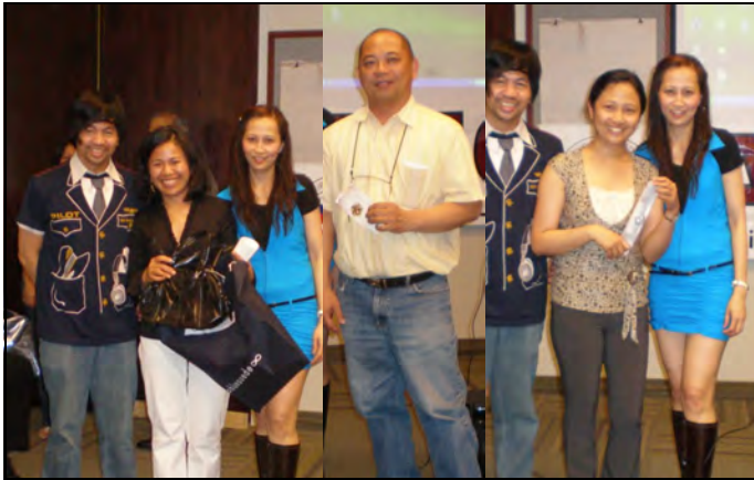
Most visible volunteer and Team leader awardees