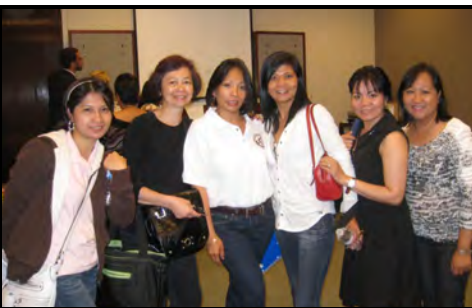
HST Ready ladies