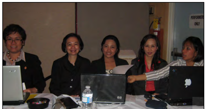
Search for Ms. PIDC Tabulators