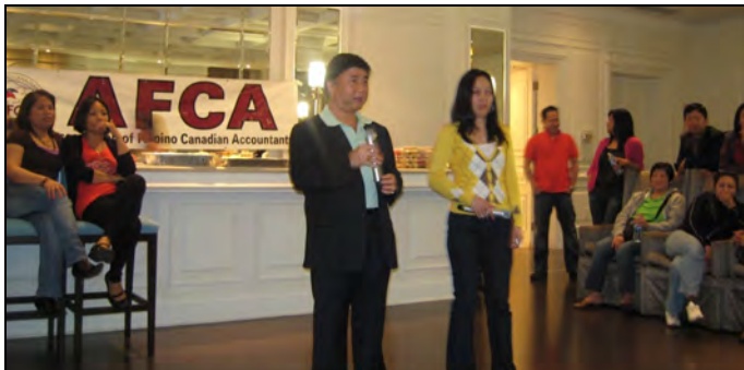
Intermission number from the Fund Raising Chair