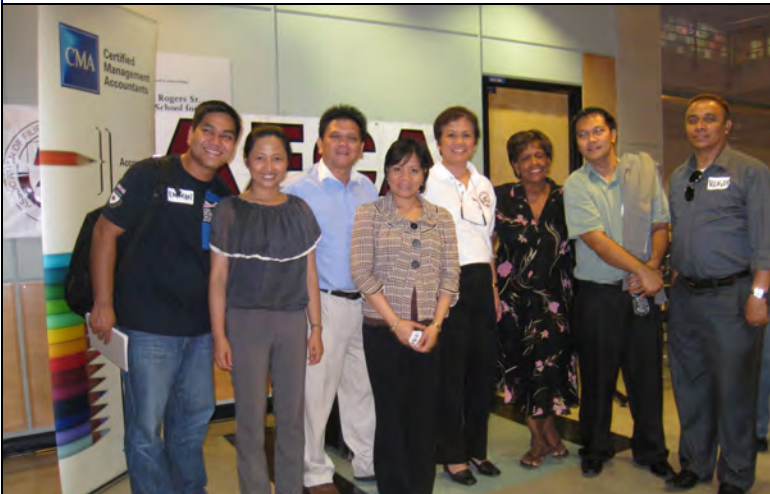
Inspired members during the Information Session