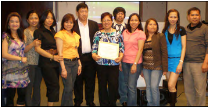
Certificate of Appreciation from CCESO