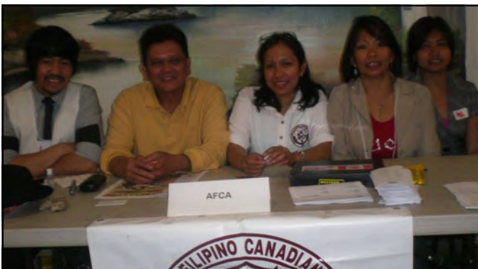
AFCA joins the New Comers Orientation at OLA