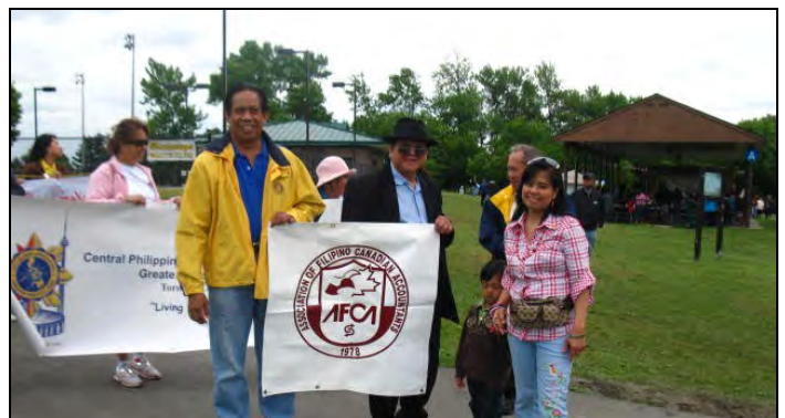
Representing AFCA at Kalayaan