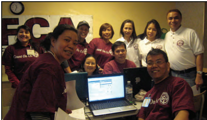
St James Town Safety Committee