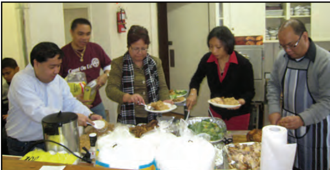
Tax Training Food Committee