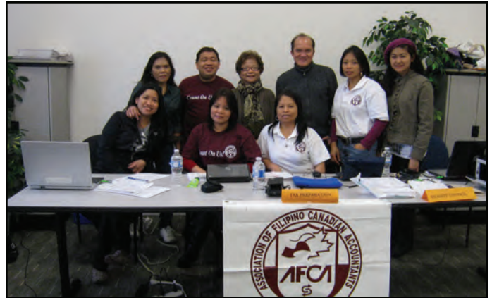
Federation of Filipino Canadians of Brampton