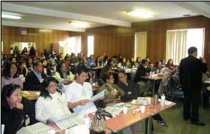
Tax Training Updates