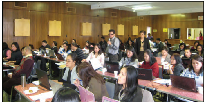
Tax Training Day 2 - Hands on Training