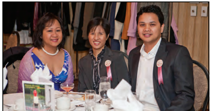
2011 New Members during the Spring Dance