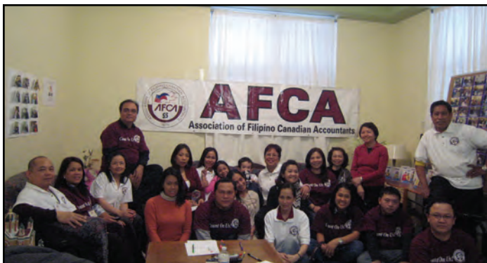
Our Lady of Assumption