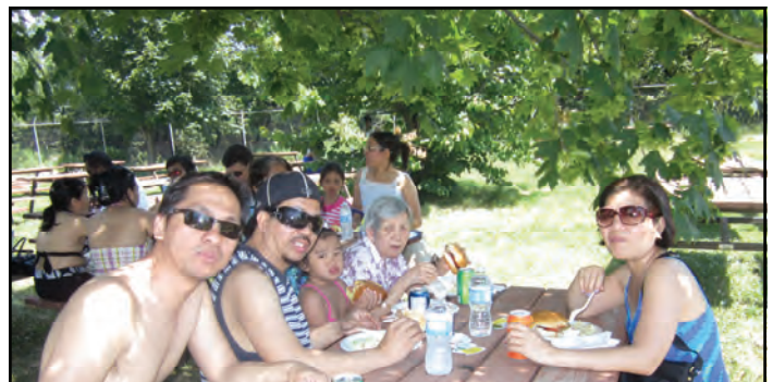
Annual Family Picnic at Wild Water Kingdom