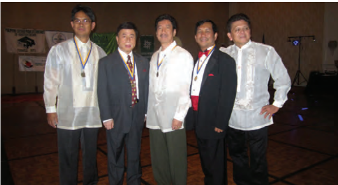
AFCA Gentlemen during the NCPACA gala night