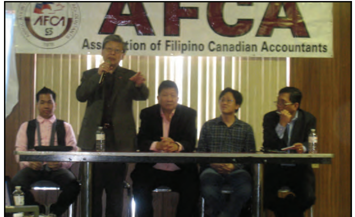
Tax Q & A - Panel of Speakers