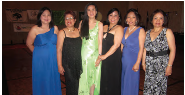
AFCA ladies during the NCPACA gala night