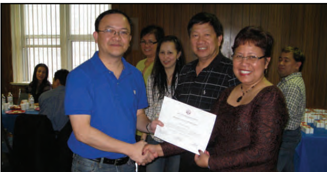
Tax Volunteer 's Appreciation Day