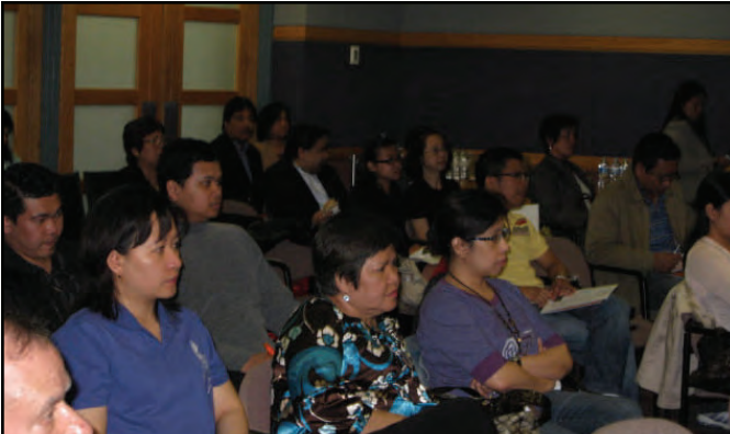
Information Session on Accounting Designation