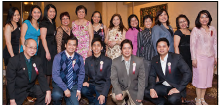
2011 Newly Inducted Members