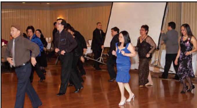
Enjoying the night during the Spring dance