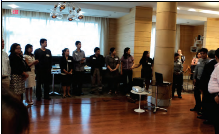
Attendees during the launching of Mentoring Program

FIL ACCOUNTANTS TORONTO CONVENTION SEPT 10-11 REGISTRATION STARTS NOW!