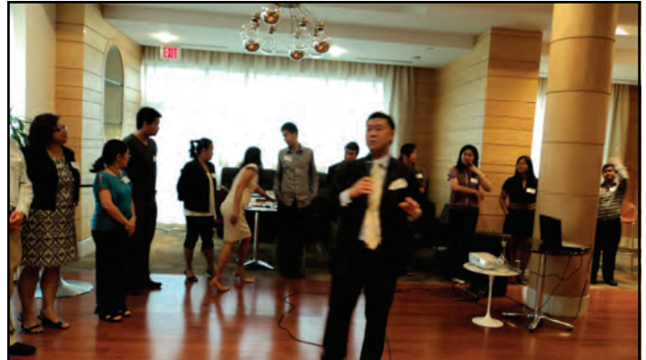
Launching of Mentoring Program