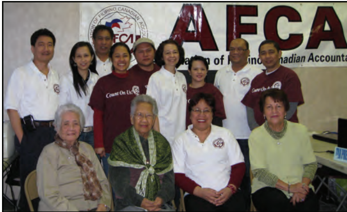
Kalayaan Community Center