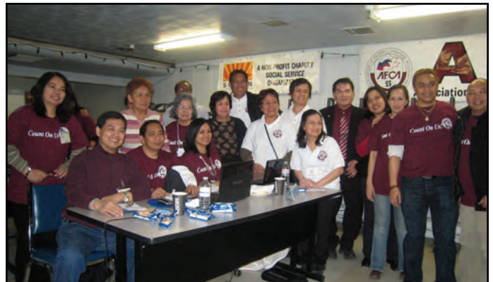
Silayan Community Center