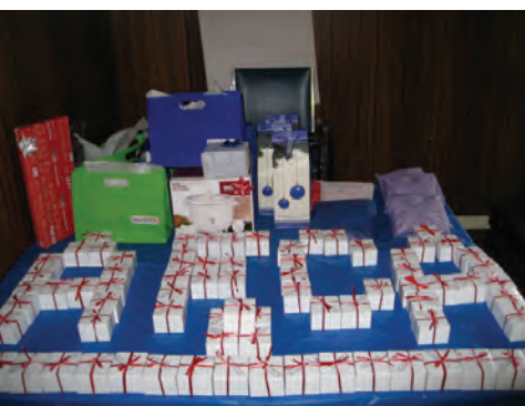
Tokens of appreciation to volunteer

The AFCA Tax Clinics is a yearly project that was developed to harness the tax preparation skills of the members on a worthwhile community endeavor. An appreciation night such as this celebrates such membership volunteerism contributing to association unity. Kudos to all those who participated!!